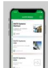
Digital Key Bluetooth LE NFC - Near Field Communication