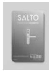
Key Card NXP MIFARE®