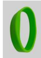
Silicone Wristband NXP MIFARE®