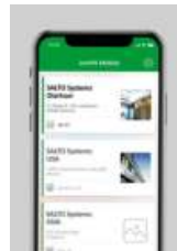
Digital Key Bluetooth LE NFC - Near Field Communication