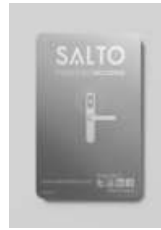
Key Card NXP MIFARE®