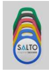
Key Fob NXP MIFARE®